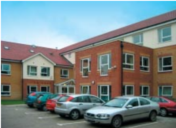
Barleycroft Care Home in Romford